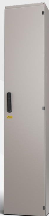
MRL-F | Floor