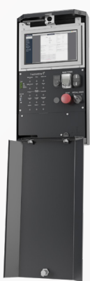
MRL-S | Shaft